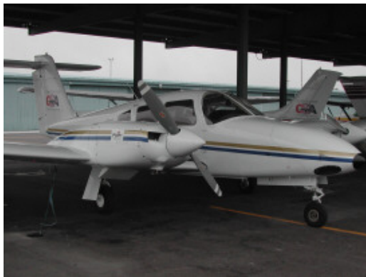
2004 Piper Seminole

Cornerstone Aviation operates out of the Salt Lake International and Ogden Airports, flying amidst some of the most beautiful and exciting terrain in the country. CSA offers superior flight training at reasonable prices. New Tecnam (Light Sport), Cirrus, Cessna, Diamond, Tiger and Piper aircraft are available for training and rental.