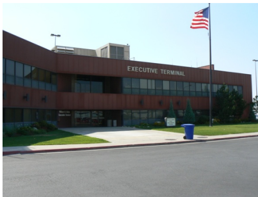
CSA Headquarters in Salt Lake City, Utah