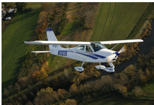
2008 Tecnam P92 Eaglet