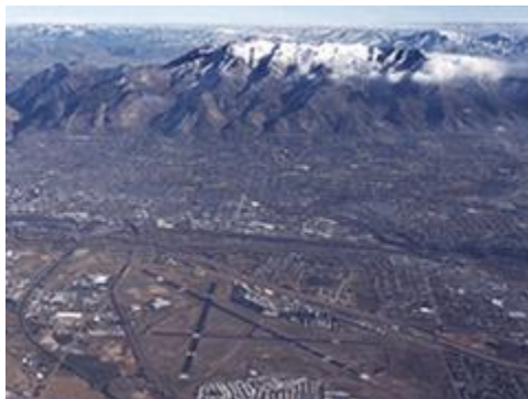
Ogden-Hinckley Airport Ogden, Utah

CSA's International Training Center at the Ogden airport will offer the best in all training scenarios. A fully operational control tower complete with IFR approaches to the various runways enhances the learning experience in the local environment. Students will acquire approximately 250 hours of flight time with CSA.